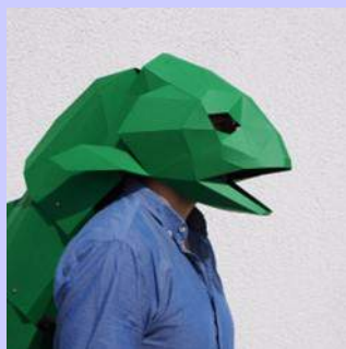
Does this fish make me look fat?

Thanks to everyone that volunteers, attends, and contributes. Your service and donations provide money to help build homes for those less fortunate. GO TEAM FISH FRY!