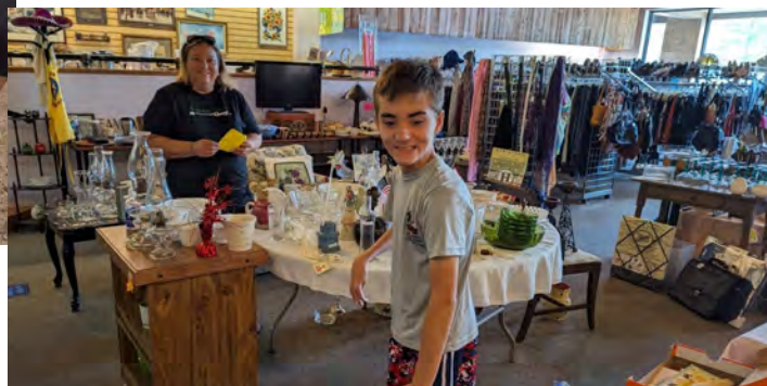
Cat Welfare Resale Store

Youth June Wednesday Missions During Wednesdays in June, the youth participated with the Columbus deanery in local mission work. We started by doing yard work for seniors in Upper Arlington and visiting the Red Line exhibit at the UA library. This exhibit detailed how red lining impacted marginalized communities and the impact that it still has today. The next week, we worked at The Catique to organize and clean their resale store before going to Cat Welfare to play and socialize the cats they have there. Finally, we traveled to Procter Camp and Conference Center to join the HS camp for activities, fellowship and volunteering in the greenhouse. We plan to continue to meet as a deanery at least twice a year as we did last year.