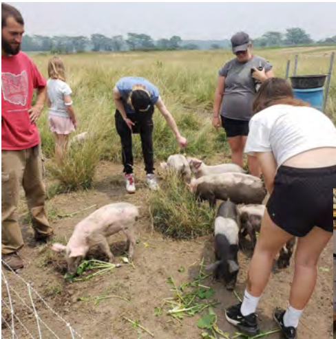
Procter Wednesday Mission