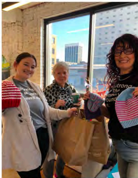
Saturday Knitting Circle