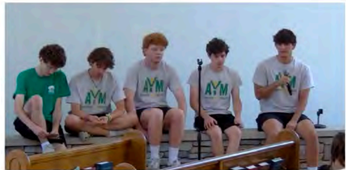
Youth Group presenting about Mission Trip