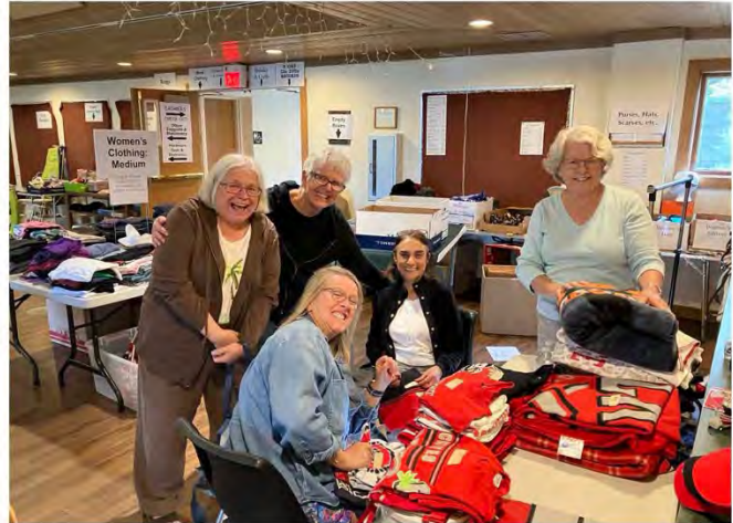
Garage Sale Workers!