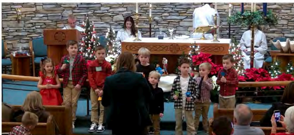
Wiggles for Jesus Handbell Ensemble!