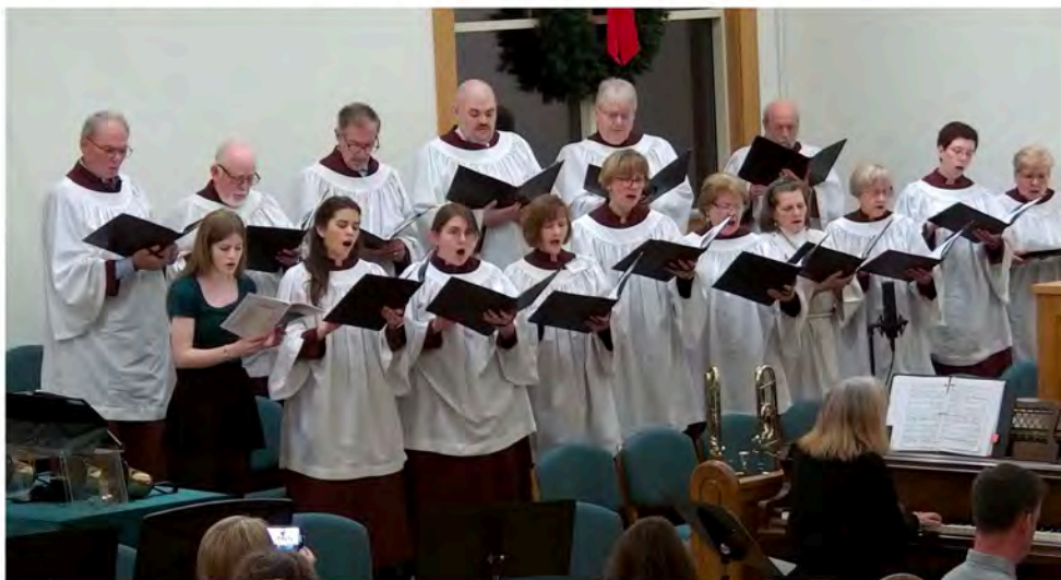
Choir on Christmas Eve