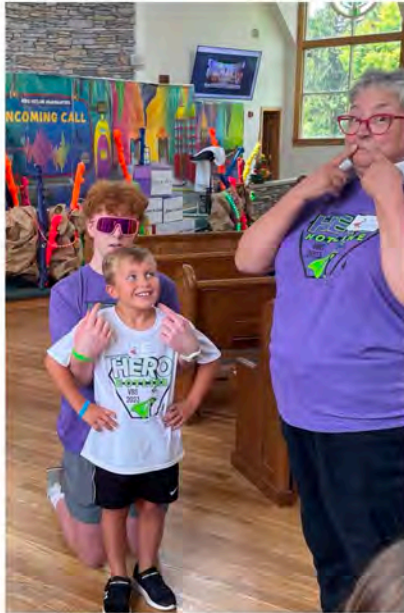
Vacation Bible School