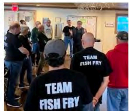
Shrove Tuesday and Fish Fry