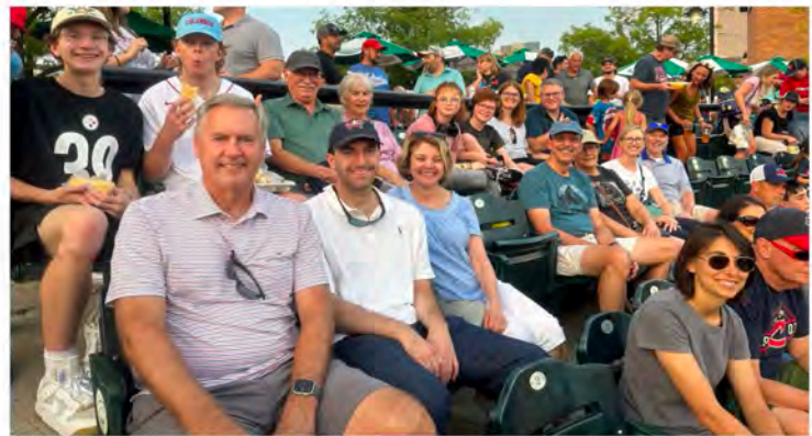
Faith Days at the Clippers' Game