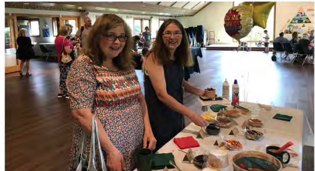
Father's Day Coffee Hour