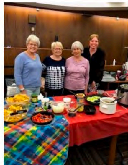
C.A.T.C.H. Court Lunch