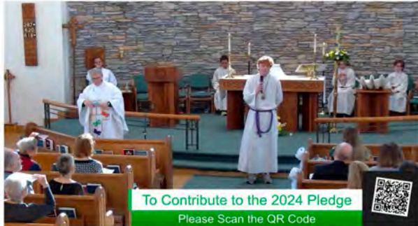
BSA Eagle Scout Presentation