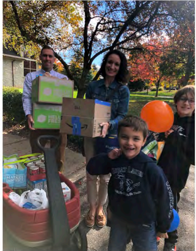
Harvest of Hope Donations for the Dublin Food Pantry