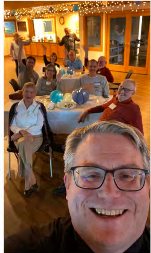
Pledge Drive Dinners!