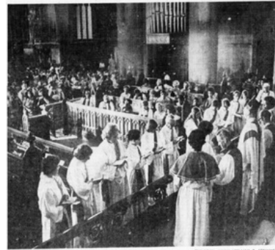
11 Women Are Ordained